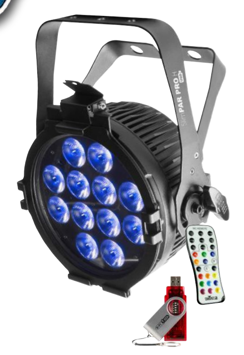
*Shown with the optional IRC-6 remote and D-Fi™ USB